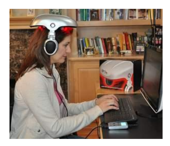
The iGrow is ideal for women who experience hair loss or thinning hair. In fact, over 40 percent of middle age women suffer from female pattern hair loss.

the iGrow goes to work. It is not only easy to use, but also convenient, affordable and with a six month money back guarantee.